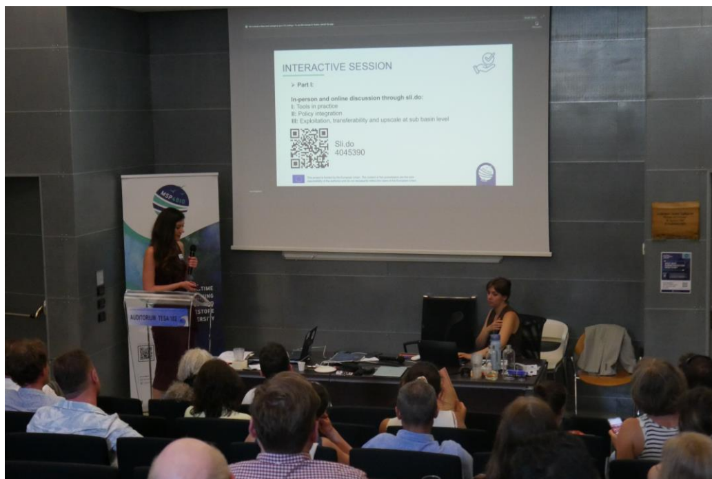
Figure 2 Interactive validation session at the MSP4BIO final event.

In response to another question, Where in your national planning process could the ESE framework or DSTs be integrated? the majority of participants highlighted the importance of integrating this into the revision of national MSP plans , the application of SEA , and the revision of MPAs management plans .